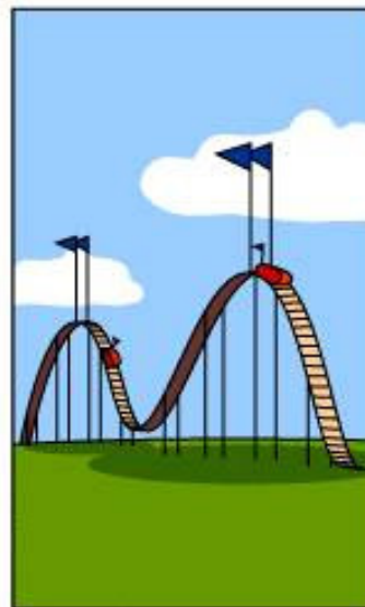
How the customer was billed