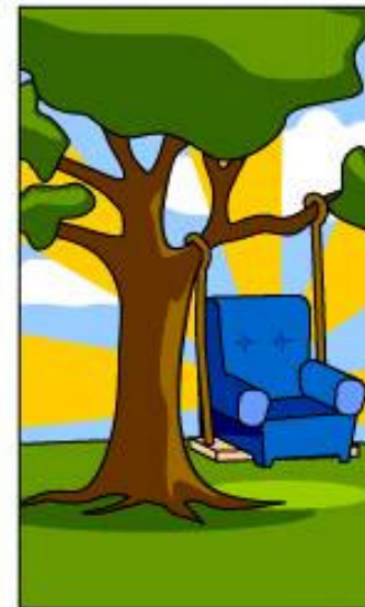
How the Business Consultant described it