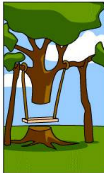
How the Analyst designed it