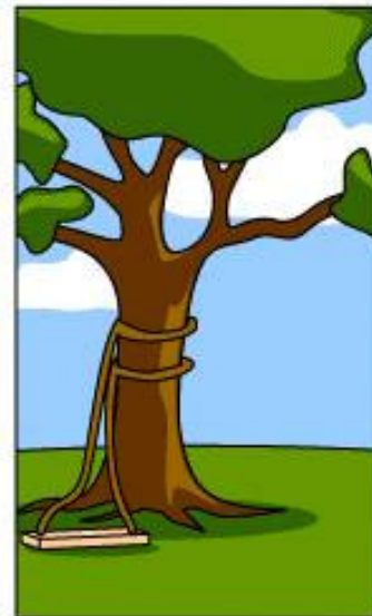
How the Programmer wrote it