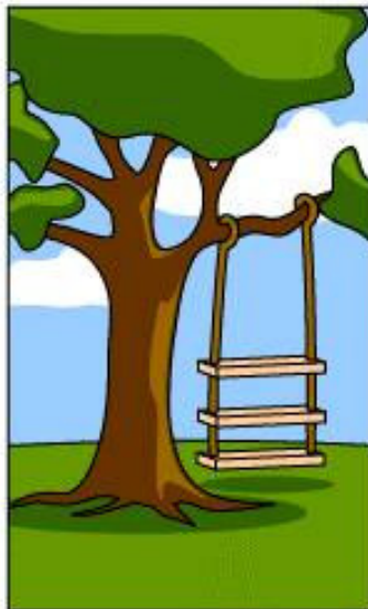
How the customer explained it