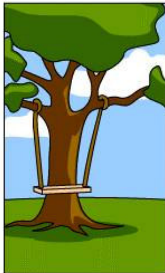
How the Project Leader understood it