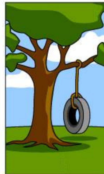
What the customer really needed