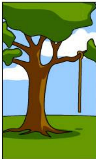
What operations installed